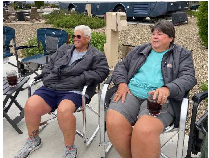
And we said it was cold??!! Our hearty souls!