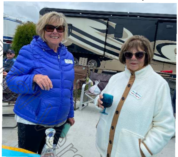
OH YEAH!! IT WAS COLD!