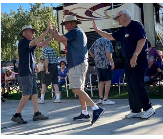
The guys think they won the Cornhole competition, but it was the Romer women who had all the right moves!