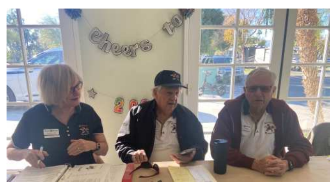
Is this working again...or yet?