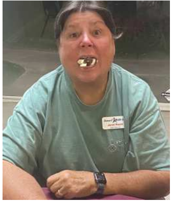
slap happy after all the work