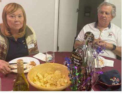
this is what we all felt like after our delicious meals