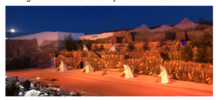
The Happy Canyon Indian Pageant & Wild West Show

took advantage of the underground tour of downtown Pendleton to experience its unique and gritty history: gambling, bootlegging, opium dens, "cozy rooms" and a first hand look at the life of the Chinese immigrants who mostly lived in the rooms and tunnels below the red light district. This was truly the "wild" west!