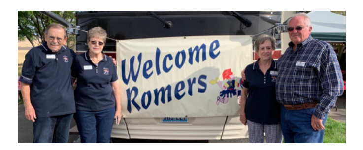
Many thanks to our Rally Hosts

On Friday we had first row seats for the Westward Ho! parade which rolled into town at 10am. Horses, wagons, long-horned cattle, marching bands, and waving Rodeo gueens made for nonstop action.