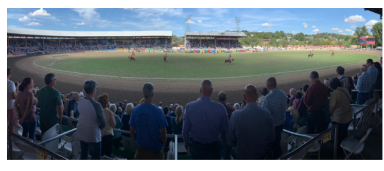
The rodeo crowd stood in solumn remembrance on the anniversary of September 11, 2001.